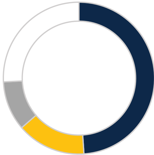
Post School Destinations

64.8% of Students received their Public University First Preference